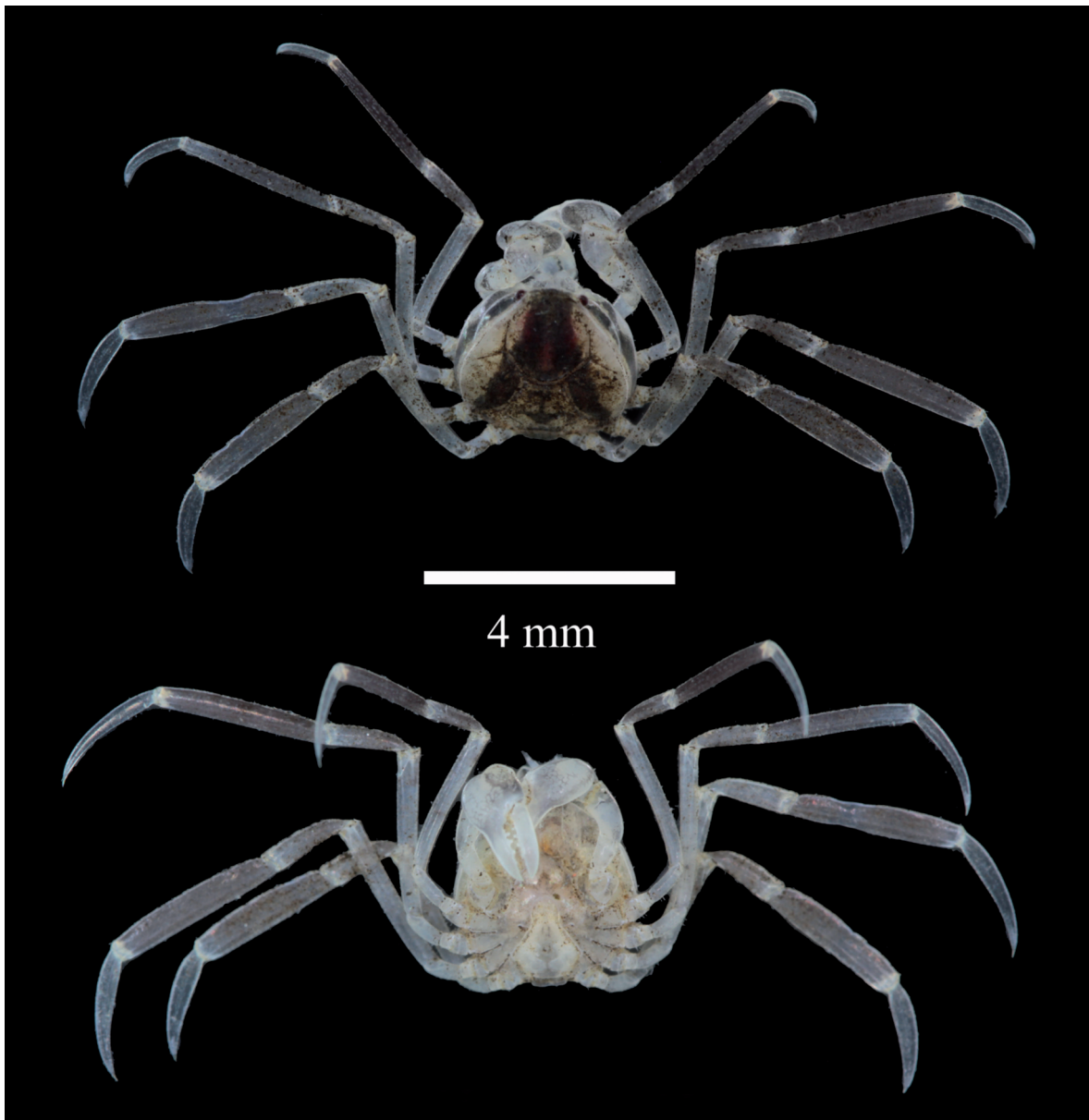
Figure 3. Holotypus of Elamena soonthronkitti n. sp. from Upper Gulf of Thailand.