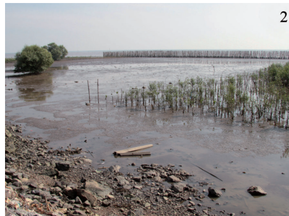
Figures 1, 2. Bangpu mangrove area, Samutprakan Province, Upper Gulf of Thailand.

VARIABILITY. Males (Figs. 3-11) differ from females by the abdomen shape and size (narrower in males) (Figs. 11-12).