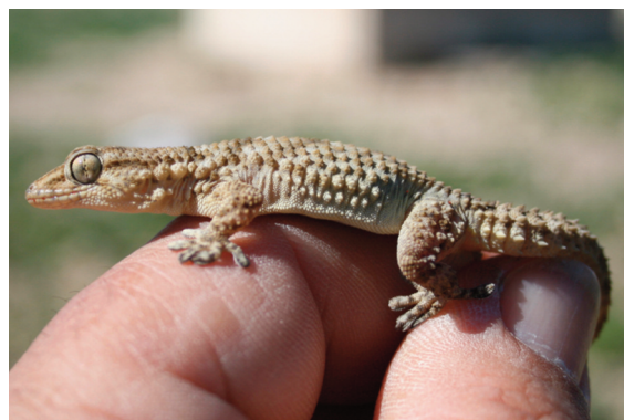
Figure 2. Tarentola fascicularis from Great Kuriat.