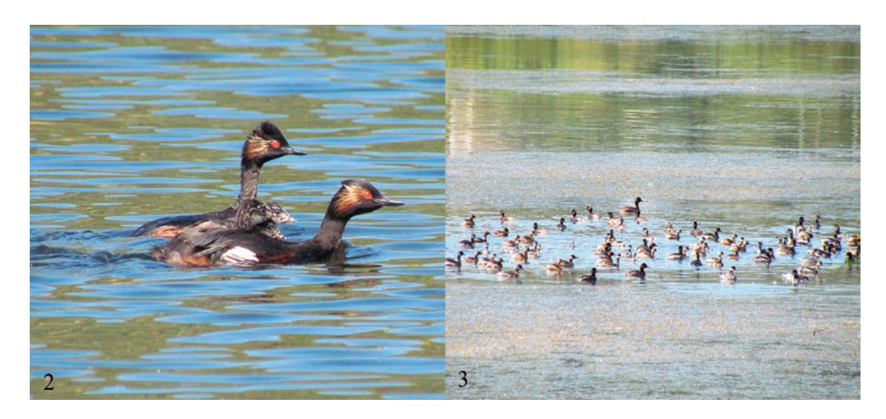
Figure 2. Swimming adult with three chicks on its back in the "Lago di Pergusa". Figure 3. Young grouped in large crèche.

the salty conditions were so marked that they resulted in an almost complete absence of its biotic component.