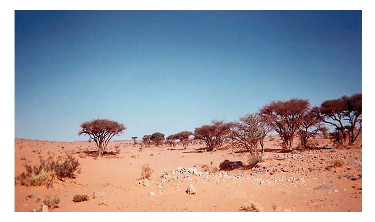
Figure 16. Acacia tortilis, Tamanrasset, Algeria.

vealed its presence in the South with another presence in the region of Biskra (Fig. 9). The height that this tree can reach is 17 meters and 60 cm in diameter at breast height. It is common in several parts of Africa, especially to the North of the equator (Menzies et al., 1996).