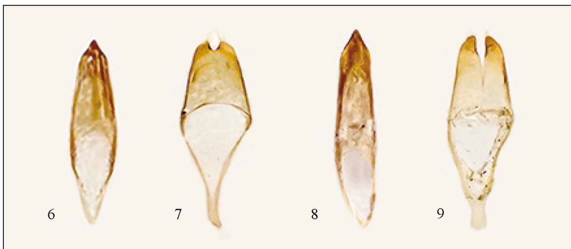
Figure 6. Purpuricenus coccineus aedeagus. Italy, Calabria (RC), Caulonia, Villaggio Ziia, Località Strada Ferrata, 1040 meters, 1.VI–22.VII.2017. Figure 7. Purpuricenus coccineus paramers, same data of figure 6. Figure 8. Purpuricenus globulicollis aedeagus. France, Herault, Ceilhes, VII.1999. Figure 9. Purpuricenus globulicollis paramers, same data of figure 8.

COMPARATIVE NOTES. We studied the type and 6 specimens (5 males and 1 female); they are perfectly fit with the type.