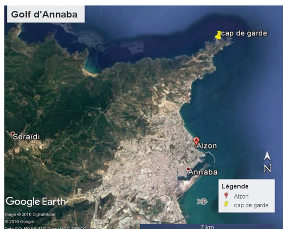
Figure 1. The study area: Gulf of Annaba (Algeria).

Samples of S. spinosulus , approximately 3 cm thick tissue and 10 individuals per station, were collected in free diving between 0 and 3 m during four seasons (2016/2017): autumn (October), winter (January), spring (April) and summer (August). The samples were transported in seawater immediately to the laboratory. All the manipulations concerning the assay of the different biomarkers studied during the grinding of the tissues of the sponge were carried out at 4^{\circ}C , in ice.