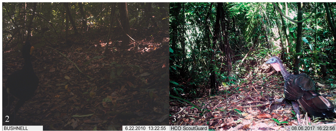
Figure 2. Records of the great curassow ( Crax rubra ). Figure 3. Records of crested guan ( Penelope purpurascens ).

Although both species were previously reported in the region during interviews with local communities in 2003 (Cossío, 2007), there was no field information on their abundance or response to habitat loss despite it being one of the main threats to their survival (Brooks & Strahl, 2006).