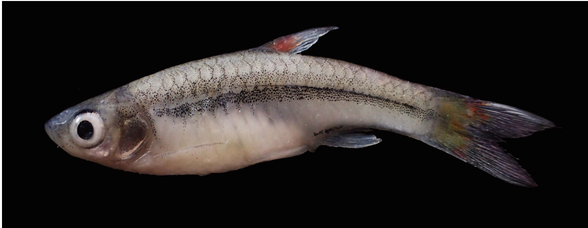
Figure 2. Rasbora rubrodorsalis , mature females, 34 mm SL, from tributary of Sieo River, Northeast Thailand.

the report of Petsut et al. (2016) are as follows: temperature of 31.0–33.5 Degree Celsius, pH of 6.35–7.32, total ammonia amount of 0.043–0.045 milligram/liter, nitrite of 0.160–0.616 milligram/liter, nitrate of 0.461–0.499 milligram/liter, and orthophosphate of 0.020–0.022 milligram/liter.