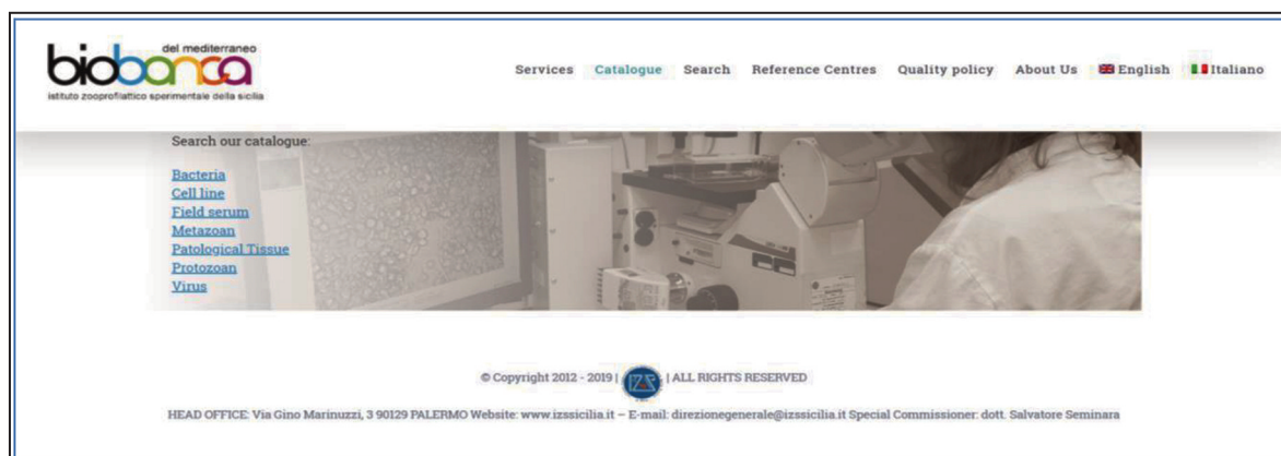
Figure 2. Page of the Biobanca del Mediterraneo website dedicated to the catalog.

The objectives of the Biobank are the promotion and implementation of collaborations with the scientific community in order to harmonize and standardize bio-banking practices, according to international OIE guidelines and the development of scientific and technological research to provide services to both the scientific and business world. In fact, collected samples can be used for diagnosis,