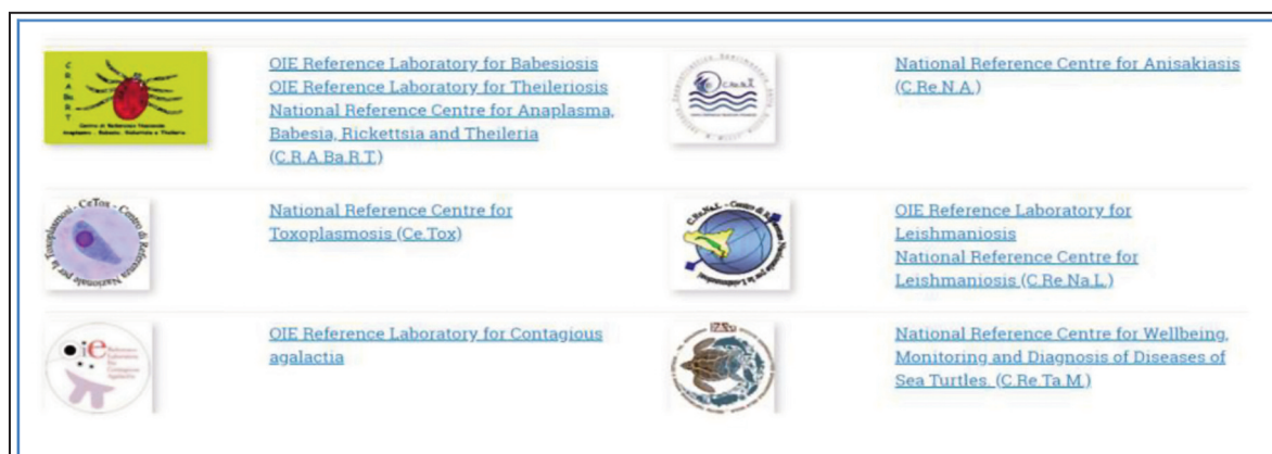
Figure 1. The OIE Reference Laboratories and the National Reference Centres of the IZS of Sicily.

Numerous matrices (bacteria, nucleic acids, parasites, positive/negative sera, stem cells, anatomical