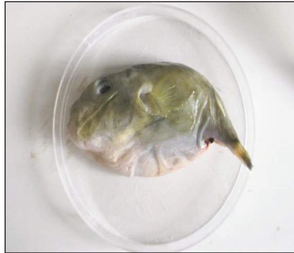
Figure 1. Sphoeroides pachygaster .

The results are reported in Table 1. Nematoda larvae (n= 9) were isolated in the coelomic cavity of 3 samples of S. pachygaster . Analysis of the morphological characteristics, observed by light microscopy, allowed to identify the parasites as Anisakis larvae Type I (sensu Berland, 1961) (Fig. 3). In the molec-