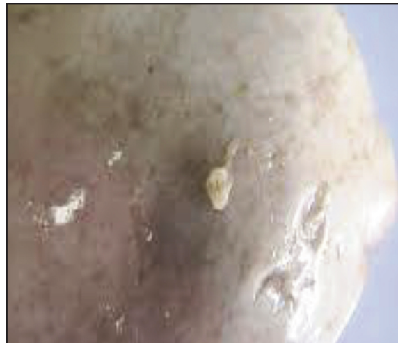
Figure 2. One larva encapsulated on the liver.