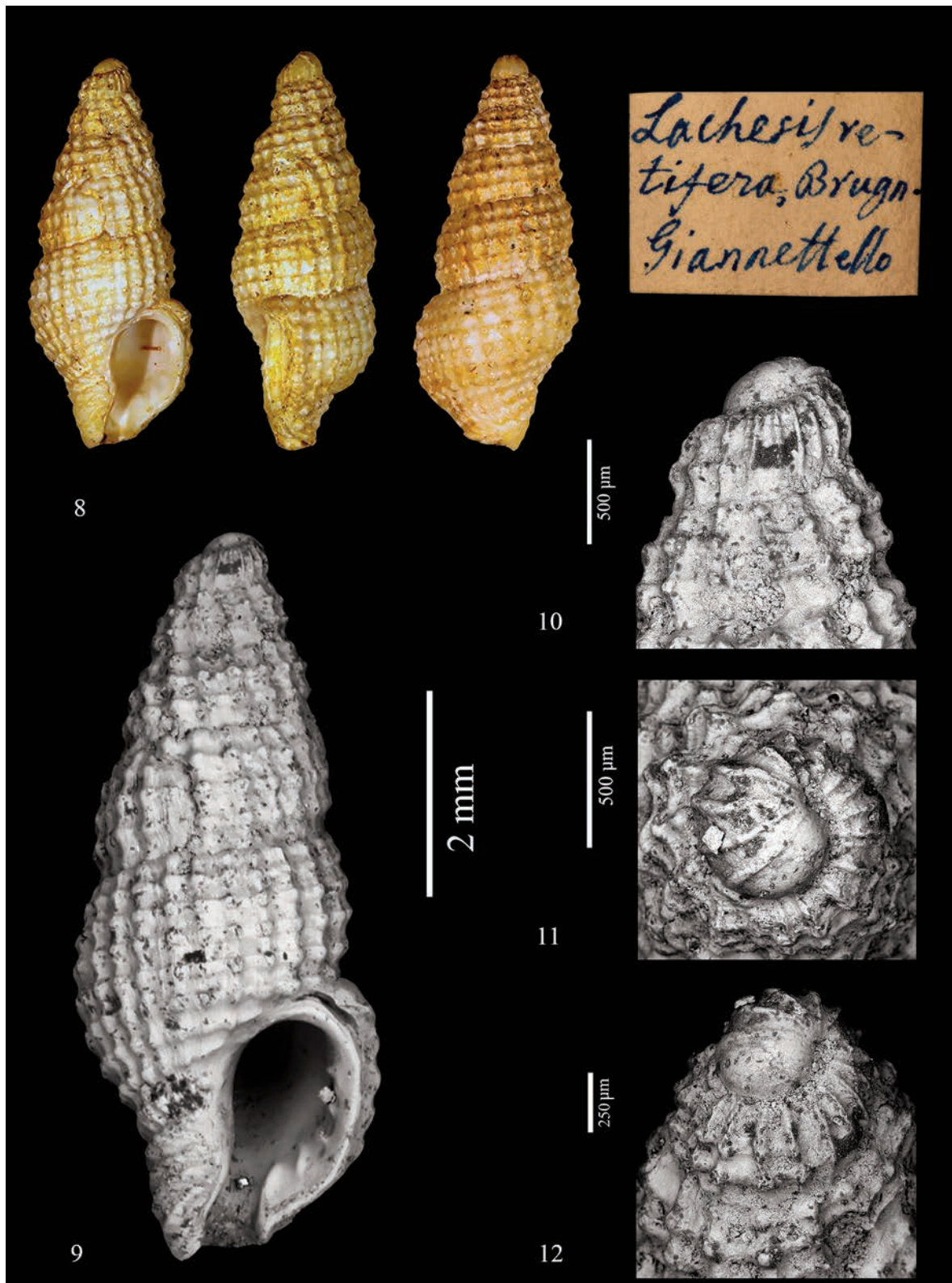
Figures 8–12. Lachesis retifera (Brugnone, 1880) from Monterosato malacological collection (MPCU). Figs. 8, 9: shell and original label. Figs. 10–12: protoconch.