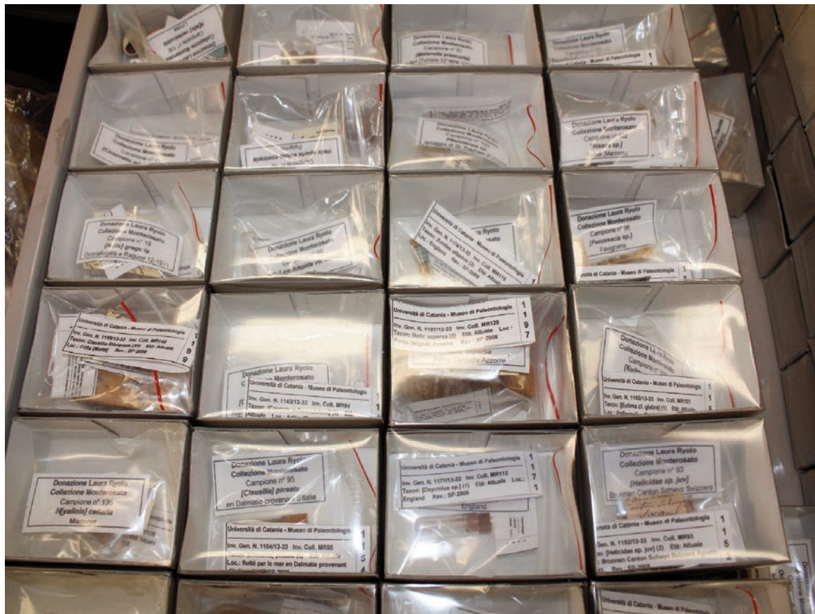
Figure 1. The Monterosato malacological collection of the Museum of Palaeontology, Catania University (Italy).