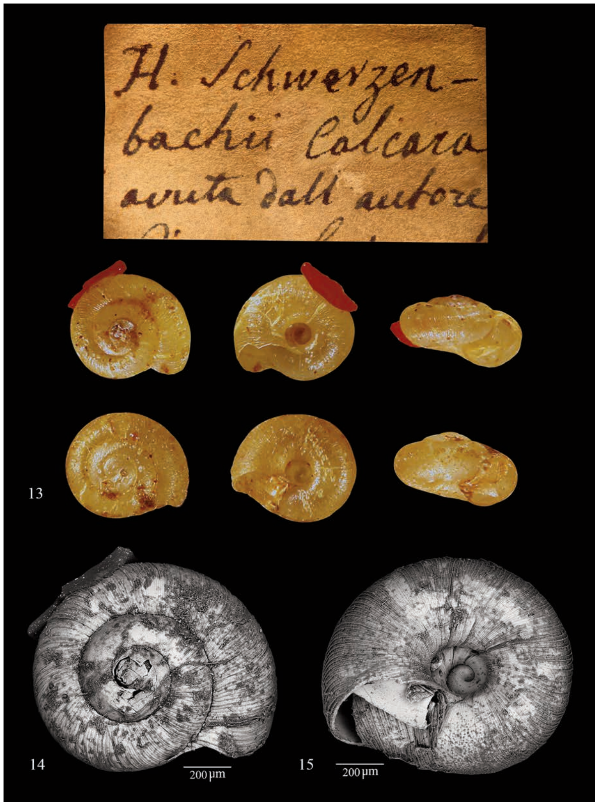
Figures 13–15. Helix schwerzenbachii Calcara, 1841 from Monterosato malacological collection (MPCU). Fig. 13: shells 1173/13–33a and 1173/13–33b and original label. Fig. 14: shell 1173/13–33a. Fig. 15: shell 1173/13–33b.