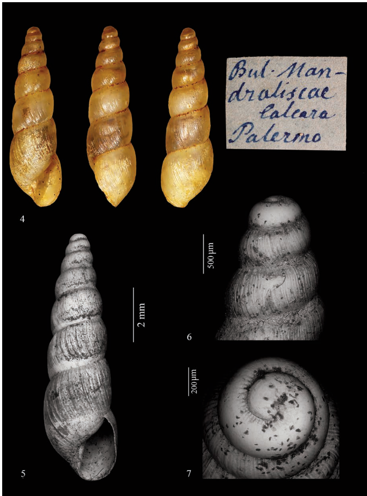
Figures 4–7. Aghatina mandralisci Calcareo, 1840 from Monterosato malacological collection (MPCU). Figs. 4, 5: shell and original label. Figs. 6, 7: protoconch.