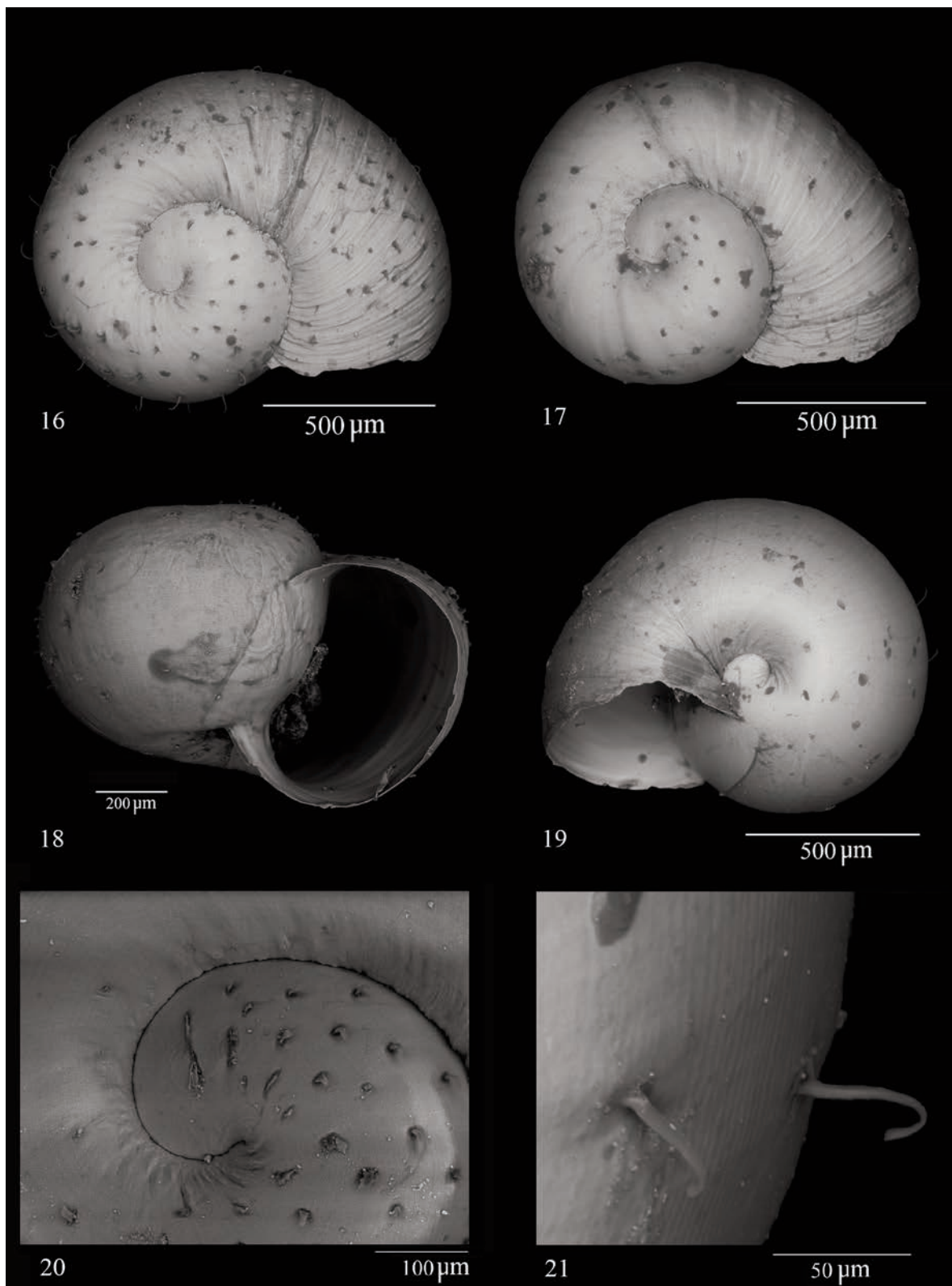
Figures 16–21. Helix cupani Calcare, 1842 from Monterosato malacological collection (MPCU). Fig. 16: shell 1198/13–33a. Fig. 17: shell 1198/13–33b. Fig. 18: shell 1198/13–33c. Fig. 19: shell 1198/13–33d. Fig. 20: shell 1198/13–33e; protoconch nucleus. Fig. 21: shell 1198/13–33e, detail of the periostracal hairs and microsculpture.