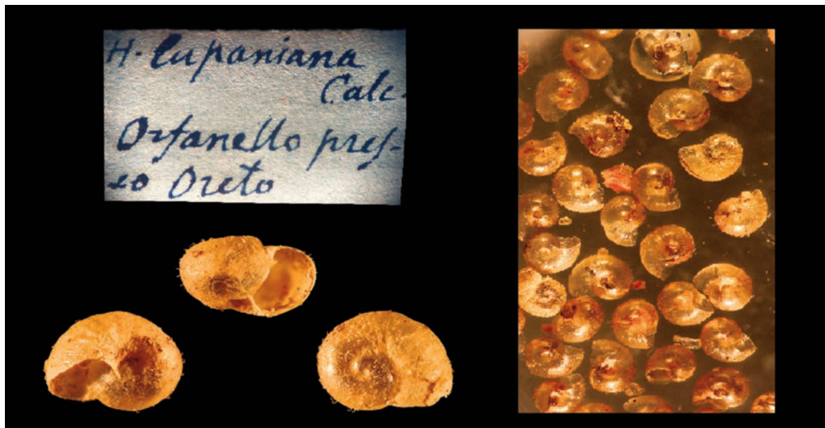
Figure 22. Helix cupani Calcara, 1842 from Monterosato malacological collection (MPCU), shells and original label.