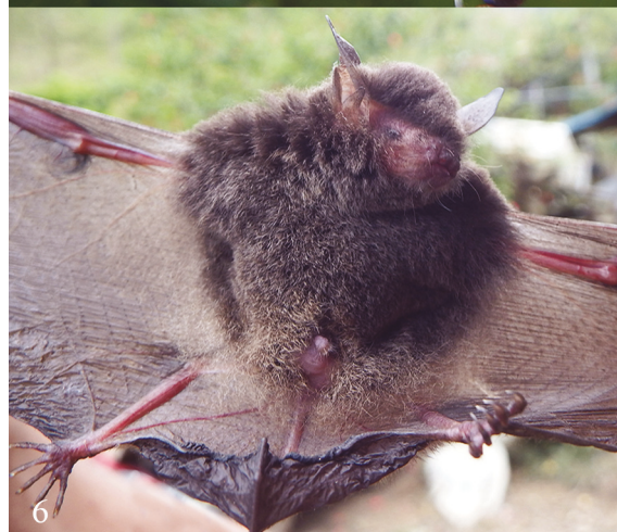
Figure 5. Frontal view of a male of Perimyotis subflavus captured in PANACAC in western Honduras during the same night with A. geoffroyi . Figure 6. Lateral view of the same specimen, note that the tragus was curved with a rounded tip.