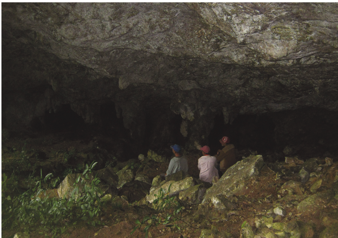
Figure 2. The entrance of the cave of El Ermitaño in PANACAC in which A. geoffroyi and P. subflavus were roosting.

were recorded to the nearest 0.01 mm with a digital caliper, following Srinivasulu et al. (2010), except for the tragus length and width, in which case Dietz & von Helversen (2004) were followed: forearm length (FA); tibia length (Tib); ear length (E); ear width (EW); thumb length (Th); noseleaf length (LN); tragus length (Tr); tragus width (TrW); calcaneus length (Ca); tail length (T); body length (BH); hindfoot length (HF); wingspan (WS); third metacarpal length (3mt); length of the first phalanx of digit III (1ph); length of the second phalanx of digit III (2ph); and length of the third phalanx of digit III (3ph).