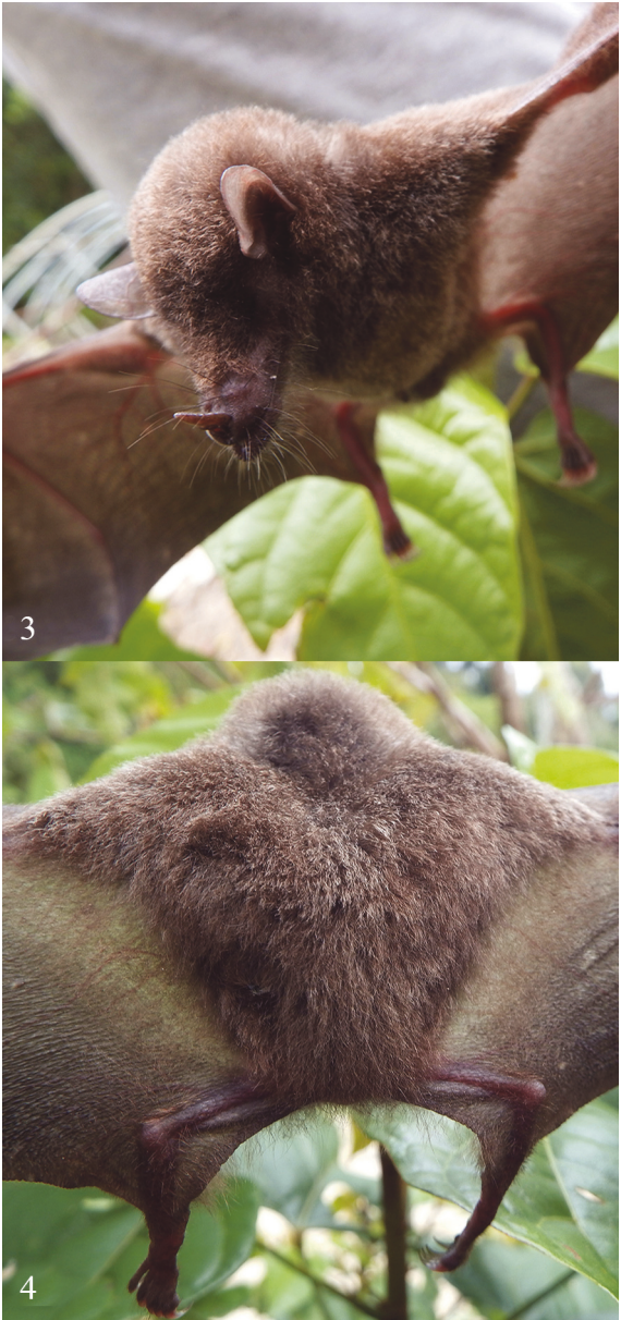
Figure 3. Frontal view of a male of Anoura geoffroyi captured in PANACAC during the night of 31 October 31, 2017. Figure 4. Note the reduced and heavily furred uropatagium.

record of Perimyotis subflavus in Honduras and the southernmost record of the species. After these records, there was no further information about the species in Honduras. McCarthy et al. (1993) described a new record of a male of P. subflavus at 16.5 km (by road) SSW Dulce Nombre de Culmí in Olancho, eastern Honduras. The record mentioned by them was done by W.J. Bleier on 22 July 1971