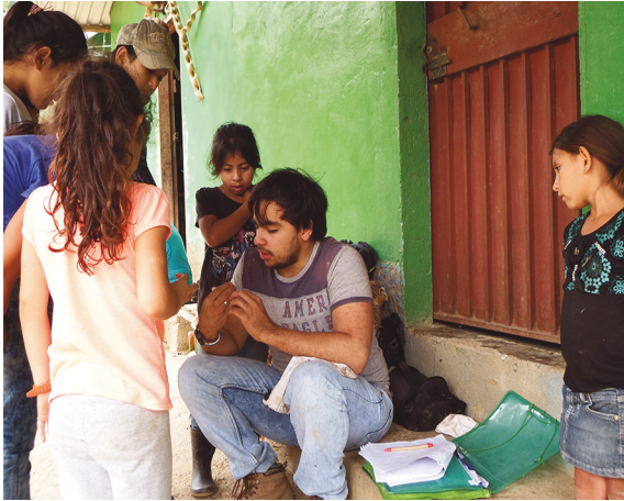
Figure 7. Teaching the importance of the conservation of bats to children in the municipality of Florida, Copán, western Honduras.