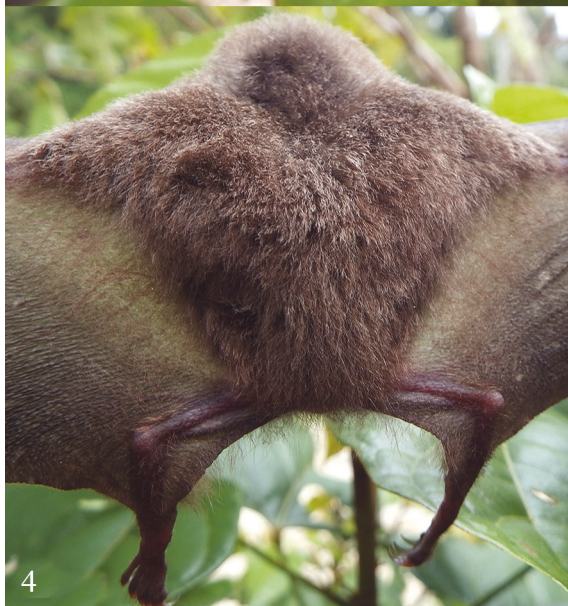
Figure 3. Frontal view of a male of Anoura geoffroyi captured in PANACAC during the night of 31 October 31, 2017. Figure 4. Note the reduced and heavily furred uropatagium.