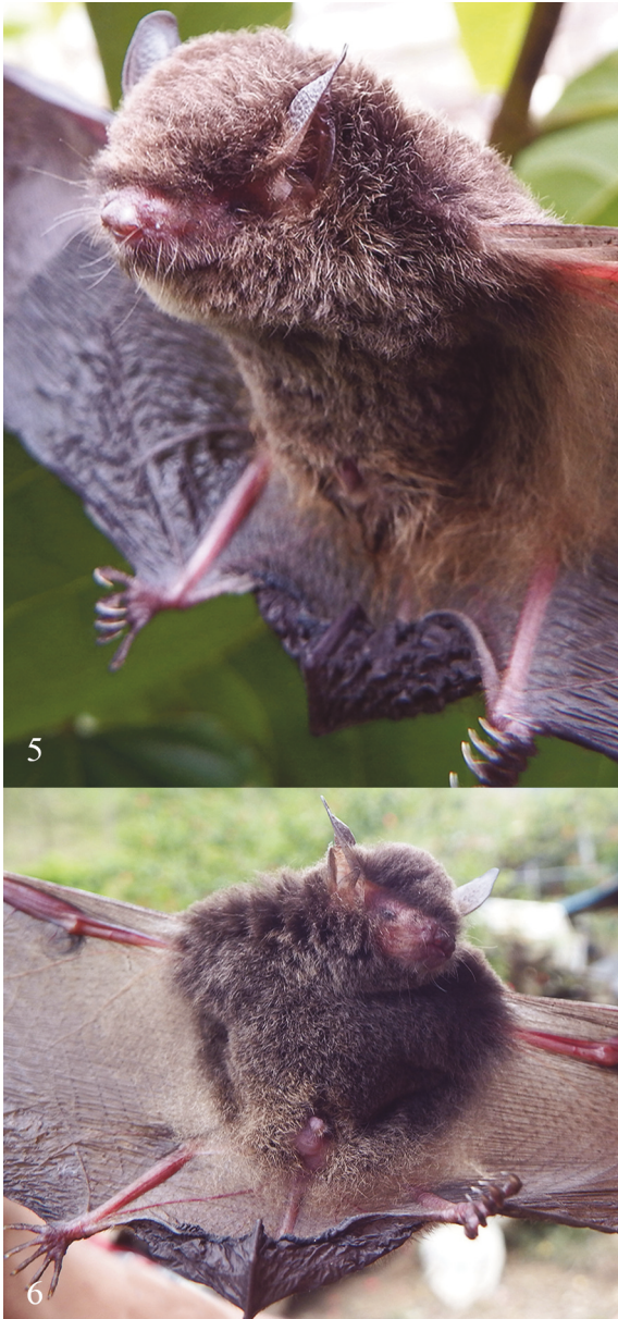
Figure 5. Frontal view of a male of Perimyotis subflavus captured in PANACAC in western Honduras during the same night with A. geoffroyi . Figure 6. Lateral view of the same specimen, note that the tragus was curved with a rounded tip.