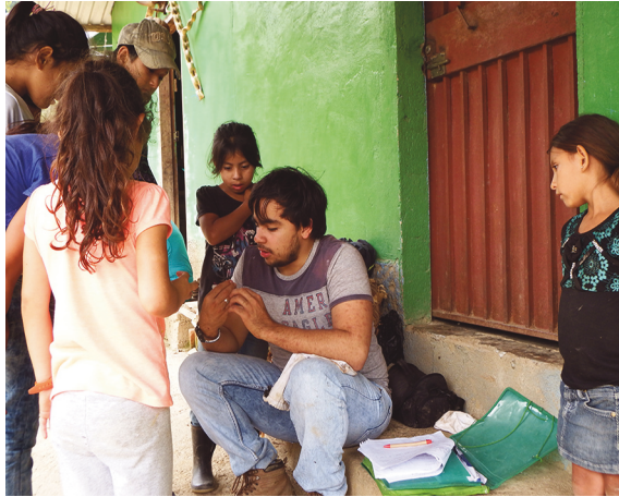
Figure 7. Teaching the importance of the conservation of bats to children in the municipality of Florida, Copán, western Honduras.