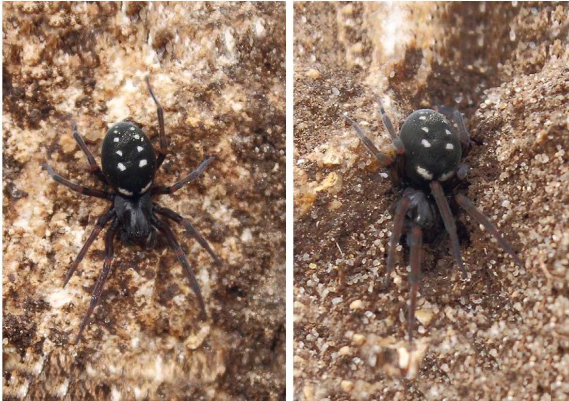
Figure 2. Nurscia albomaculata photographed in Pantano Cuba on 25.V.2016.

REMARKS. New genus and new species for Sicily; specimen found under a stone and photographed (Figure 2), but not sampled. Considering the well-defined pattern and the distribution of the N. albomaculata species, the authors identified it as such. In addition, another specimen (legit Angelo Ditta) was sampled in Mazara del Vallo (TP) on 5.I.2021, which confirms the identification made by photography.