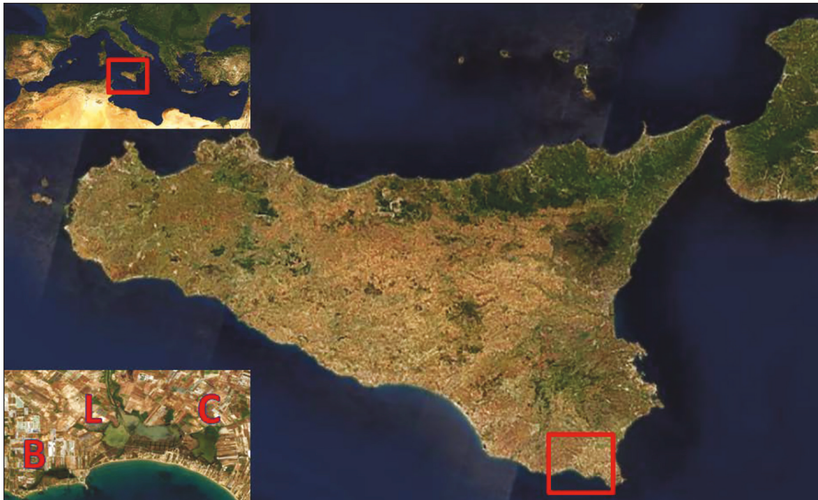
Figure 1. Geographical location of the study area: Pantano Bruno (B), Pantano Longarini (L) and Pantano Cuba (C), in the southeastern coast of Sicily, Italy.

Despite of the remarkable biodiversity richness of this area, the most of the updated scientific studies and monitoring projects were focused on avifauna (Galasso et al., 2021) and, only recently, on some groups of arthropoda, such as dragonflies (Galasso et al., 2016; Galasso et al., 2020), but never before on spiders and opiliones.