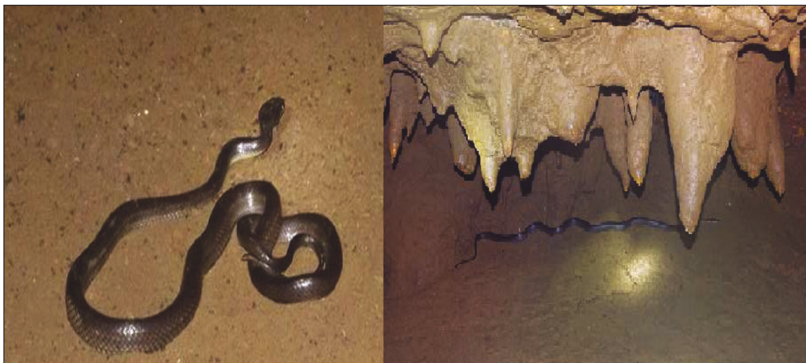
Figure 2. Stegonotus muelleri (Muller's Wolf Snake).

There were two species ( n = 1 individual) found in Wilderness cave (A), Ararat cave (C), Katamisan Cave (D), and Simbahan Cave (G). The Taonaga (F) cave recorded three species whereas Sampyagit cave (H) recorded only one individual ( N = 1 species). Based on observations, several anthropogenic disturbances detected in caves may be one factor for few individuals and species recorded as was seen in Wilderness cave, Magdagohong cave, and Taonaga cave. Threats include vandalism, treas-