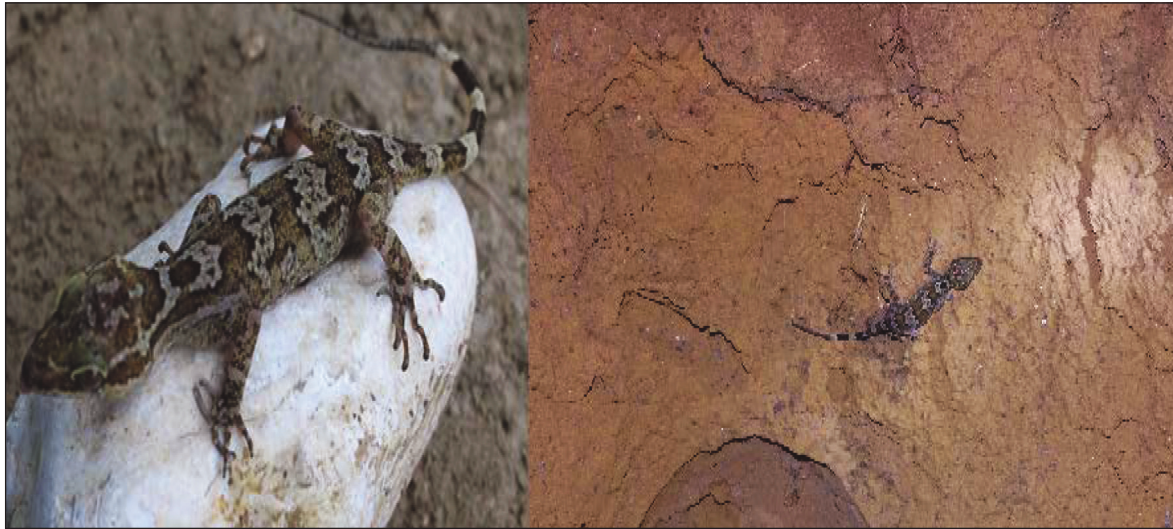
Figure 3. Cyrtodactylus agusanensis (Agusan Bent-toed Gecko) and its microhabitat.