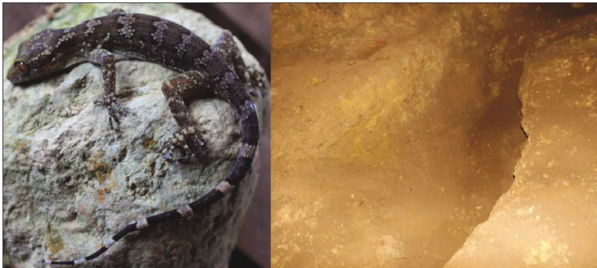
Figure 4. Cyrtodactylus annulatus (Annulated Bow-fingered Gecko) and its microhabitat.

adapted to inhabit karst ecosystem and cave habitat given their adeptness on climbing rock walls and use cave habitat as foraging or refuging site (Bauer et al., 2002; Esmaeili-Rineh et al., 2016). The colubrid snake S. muelleri ; and skink lizard S. fasciatus were both found in the deep zones of the caves. The S. muelleri was also reported to occupy cave habitat (Barnes & Knierim, 2018) whereas S. fasciatus is uncommon and no previous reports documenting this species to occur on cave habitats. These species are referred to as troglomorphic reptiles which utilize cave habitat for shelter and source of