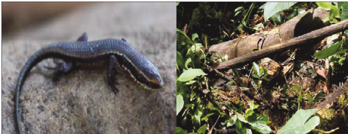
Figure 5. Eutropis caraga (Caraga Sun Skinks) and its microhabitat.

In the same manner, Otosaurus cumingi was found inhabiting the wall crevices of Agpan cave while S. fasciatus was found in the deep zone of Agpan inhabiting in a pile of rock. This result mainly attributed to the food preference of skinks as they are mainly insectivorous (Pope, 1955; Berkovitz & Shellis, 2017). They feed on insects and spiders that are found roaming around rotten logs, ground, and leaf litter inside and around cave entrances.