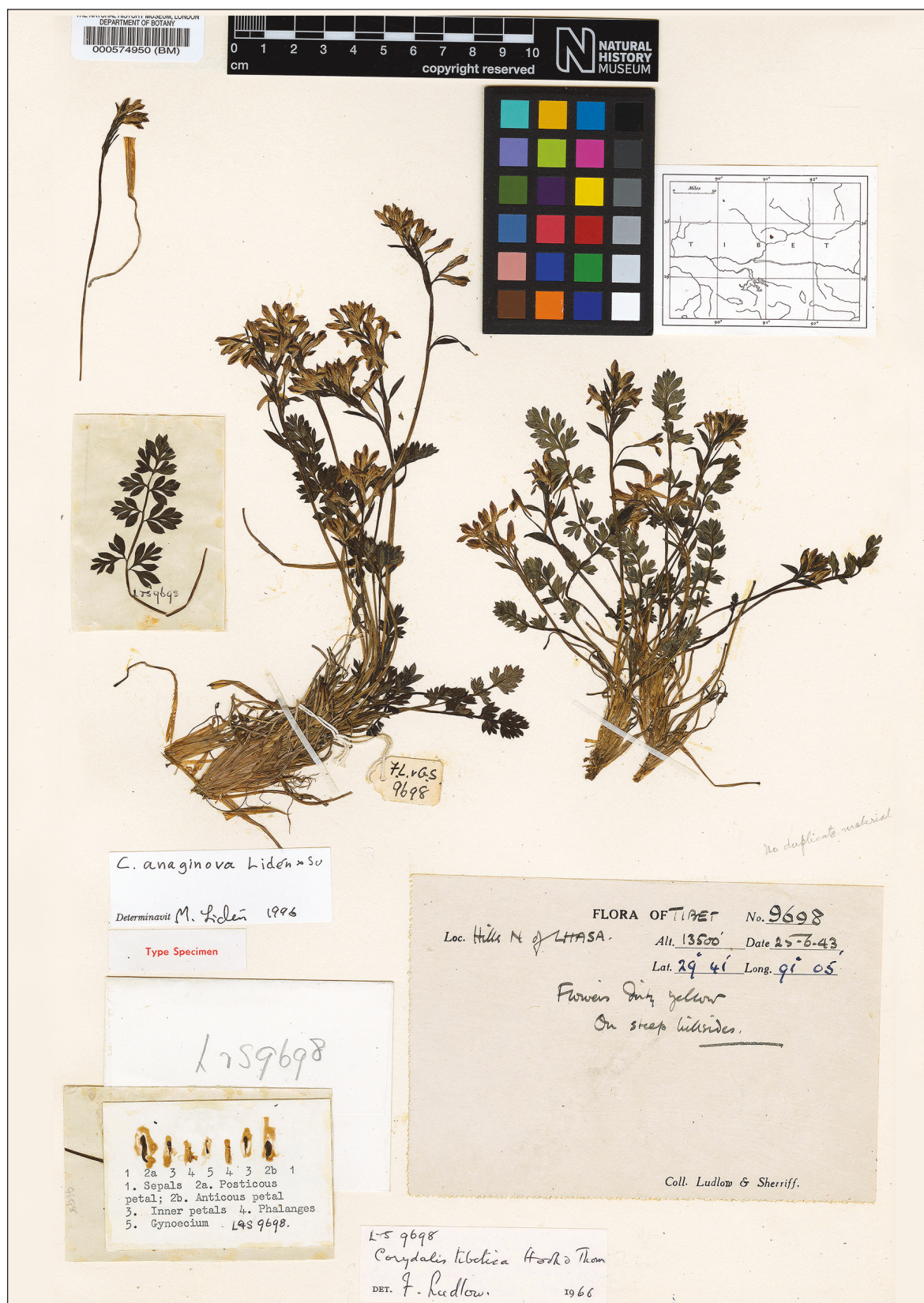
Figure 1. Holotype of Corydalis anaginova (BM [000574950!]).