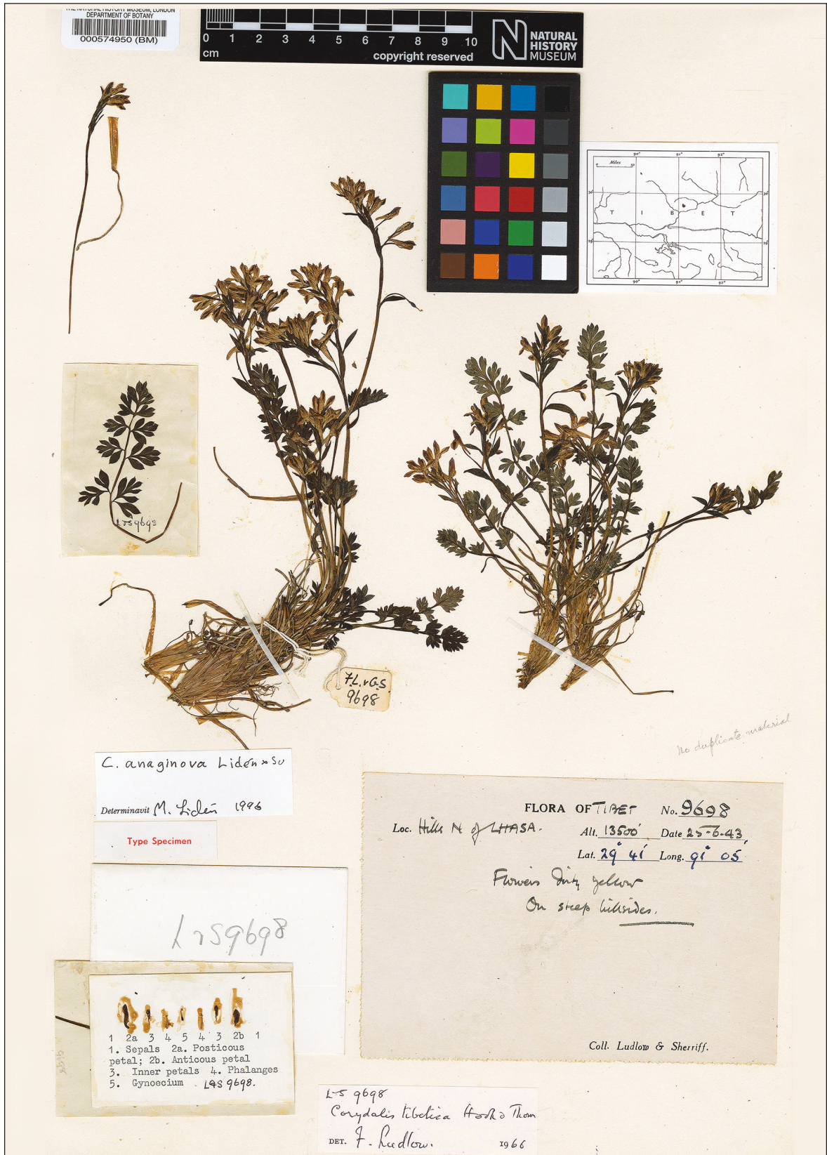
Figure 1. Holotype of Corydalis anagynova (BM [000574950!]).