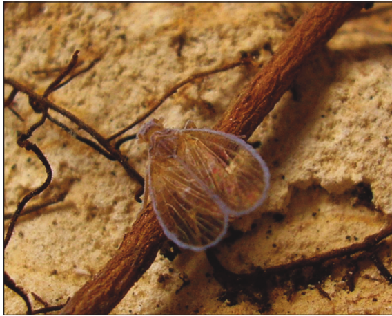
Figure 2. Ibleocixius dunae , male: Sicily, Grotta Di Natale, Priolo Gargallo, Siracusa.