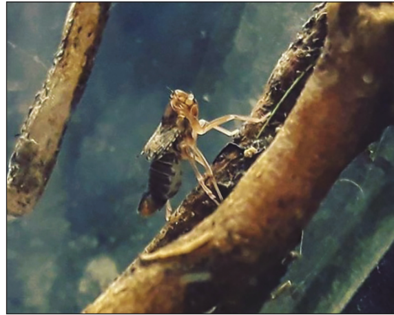
Figure 3. Cixius n. sp., male: Sicily (Catania), Etna.