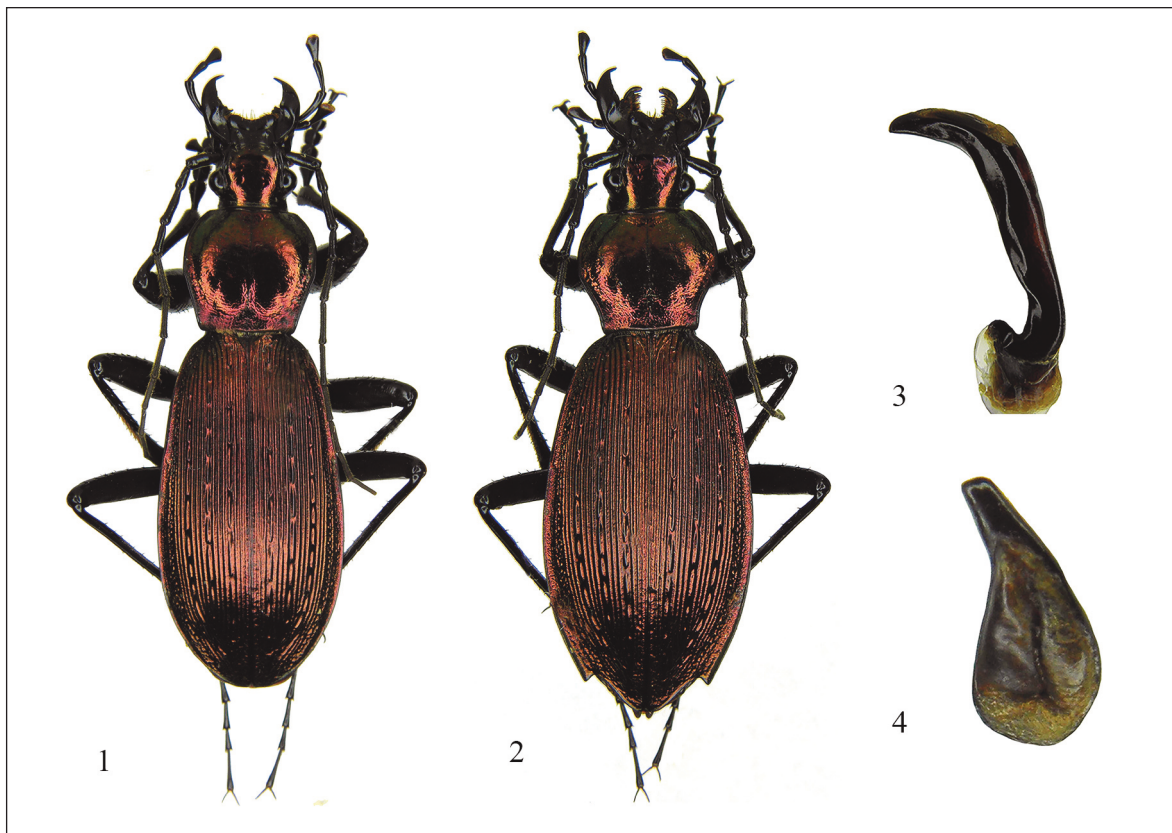
Figures 1–4. Carabus (Apotomopterus) narcissus n. sp. Fig. 1: holotype male. Fig. 2: paratype female. Fig. 3: holotype aedeagus lateral view. Fig. 4: idem, frontal view.

Aedeagus. In lateral view (Fig. 3), the median