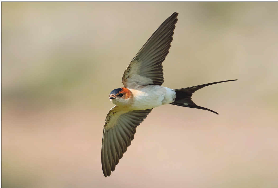
Figure 1. Adult Western Red-rumped Swallow photographed in Ustica Island (Sicily, Italy) on 19.IV.2021.

Western Red-rumped swallow was confirmed as ascertained breeder (occupied complete nests,