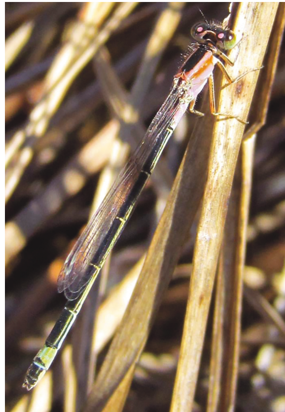
Figure 3. Ischnura genei.

Odonatological knowledge in Italy is fairly good, except for a few areas, one of which is western Sicily (Riservato et al., 2014). Historically, the collection of odonatologic data has always been limited to the central and eastern part of Sicily (Capra, 1934; 1963; Bucciarelli, 1977; Carfi et al., 1980; Carfi & Terzani, 1993). Only a few research works related to the eastern sector of Sicily have been published (Galasso et al., 2016; 2020a; 2020b; Galasso & Ientile, 2020), including those on its neighboring islands (Ragusa, 1875; Pavese & Utzeri, 1995; Corso et al., 2012). There are very few published data concerning dragonflies in the province of Trapani (Bucciarelli, 1971; Surdo 2015; 2017; 2019). The wetlands of western Sicily are characterized by wet environments with brackish waters (Capo Feto and Margi Spanò) or temporary freshwaters (Pantano Leone and Margi Milo) generally flooded from autumn to late spring. These environmental conditions do not permit the development of a rich and diversified odonatological fauna but it was still possible to make numerous observations.