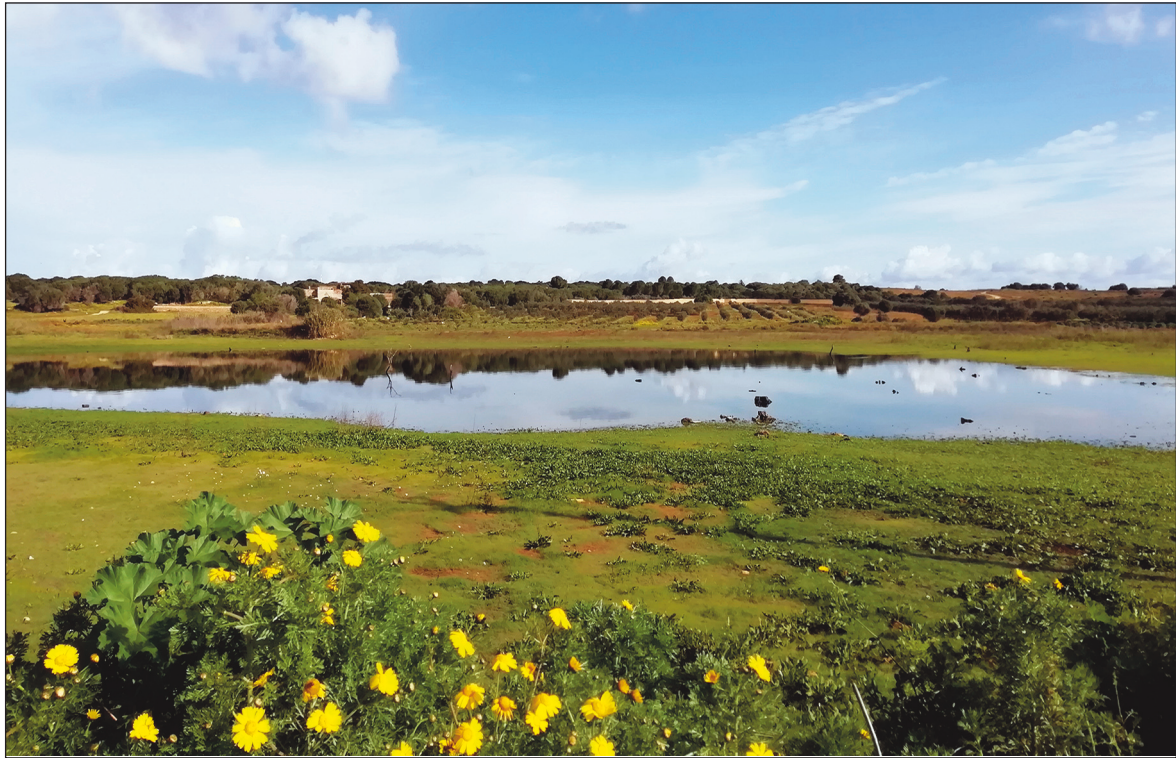
Figure 2. Panoramic view of Pantano Leone, Sicily, Italy.

water treatment plant was built, reducing the flow of water towards the “Pantano Leone”, which became a seasonal wetland. Each year, Pantano Leone dries during March/April. This wetland is next to the archaeological park “Cave di Cusa”. The surrounding area is characterized by the so-called “sciare”, a habitat characterized by the presence of garrigue with Chamaerops humilis L. associated with thorny oak ( Quercus coccifera L.). Pantano Leone is part of the SPA ITA010031 (Special Protection Area) “Laghetti di Preola and Gorgi Tondi, Sciare di Mazara and Pantano Leone”, is listed in the IBA (Important Bird Area n. 162 “Wetlands of the Mazarese”) and is included among the wetlands of international importance recognised under the Ramsar Convention. Major threats: fire, poaching, uncontrolled access by motor vehicles, illegal landfills, stray dogs, destruction of priority habitats.