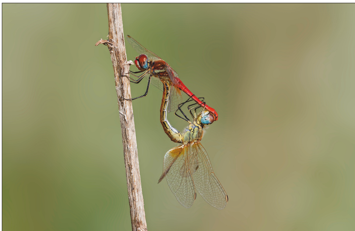
Figure 4. Sympetrum fonscolombii.

It is a south Mediterranean species living in the sandy environments of Sicily, Aeolian Islands, Maltese islands, south Sardinia and North Africa. Because of its rarity in Europe, it has been included in Annexes II and IV of the Habitats Directive as a taxon requiring strict protection. This species is recorded at Capo Feto (B. Massa, personal communication; Massa, 2011).