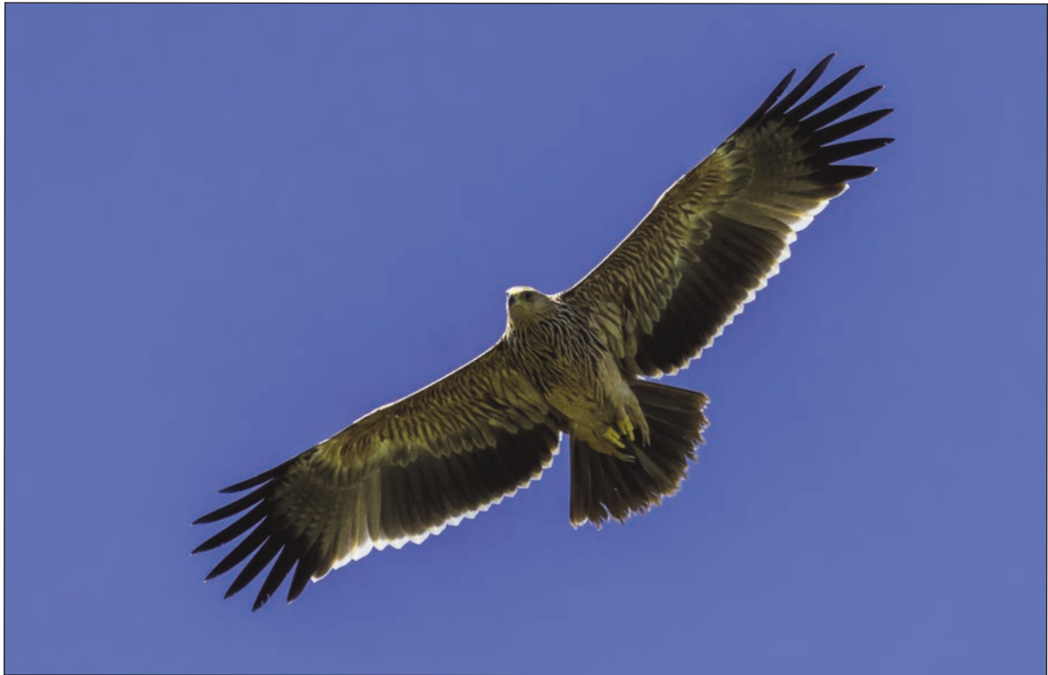
Figure 2. Eastern imperial Eagle Aquila heliaca : Lake Paceco, 14.XI.2021.