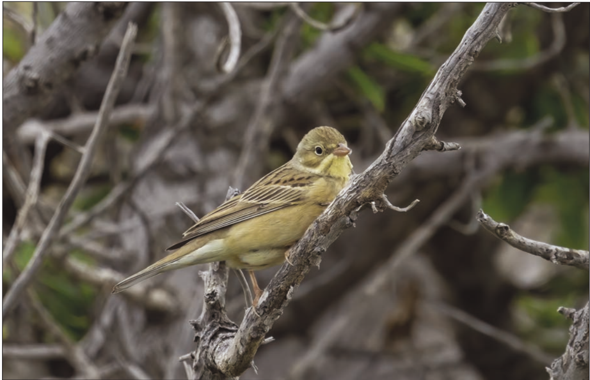
Figure 6. Ortolan Bunting Emberiza hortulana : Ustica Island, 18.IV.2021.