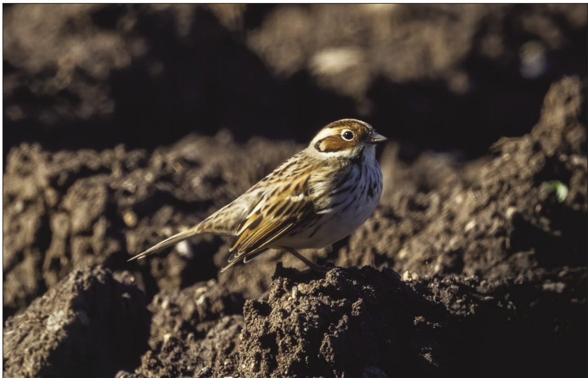
Figure 7. Little Bunting Emberiza pusilla : Ustica Island, 18.X.2021.