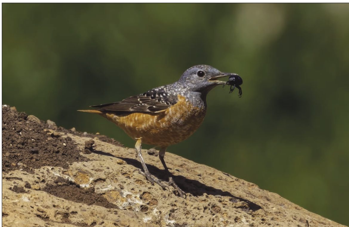
Figure 5. Common rock Thrush Monticola saxatilis : Ustica Island, 24.IV.2021.