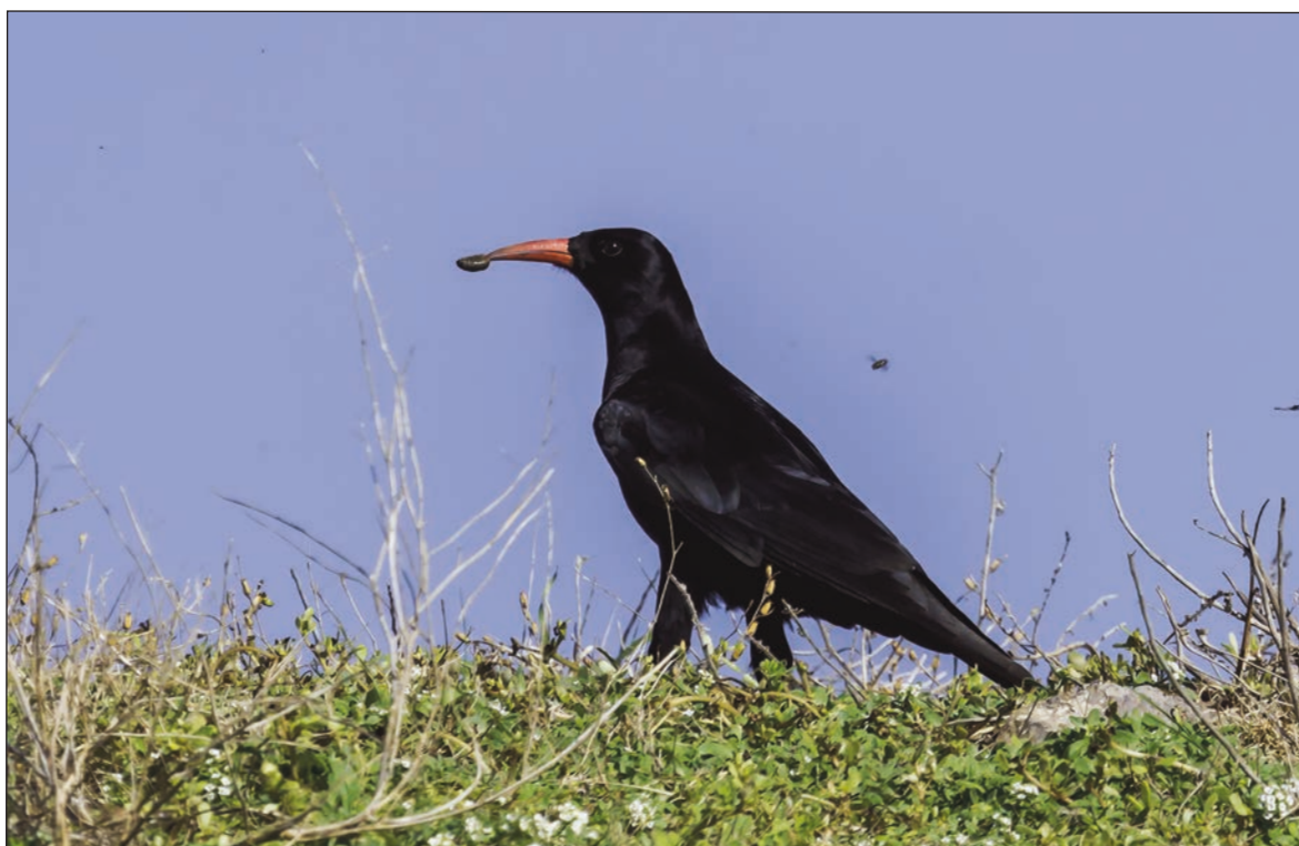
Figure 4. Red-billed Chough Pyrrhocorax pyrrhocorax : Ustica Island, 21.X.2021.