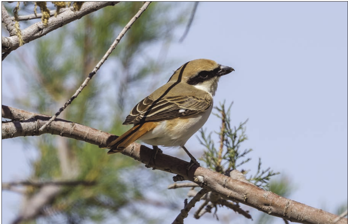
Figure 3. Red-tailed Shrike Lanius phoenicuroides : San Filippo del Mela (Messina), 16.V.2024 (photo by D. D'Amico).