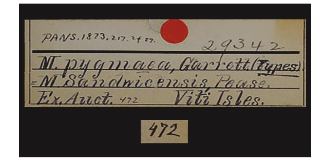
Figure 1. Museum label of the 3 syntypes of Volvaria ( Volvarina ) pygmaea Garrett, 1873; ANSP collection.

Gibberula pygmaea (Garrett, 1873) has never been rediscovered after his description. This situa-